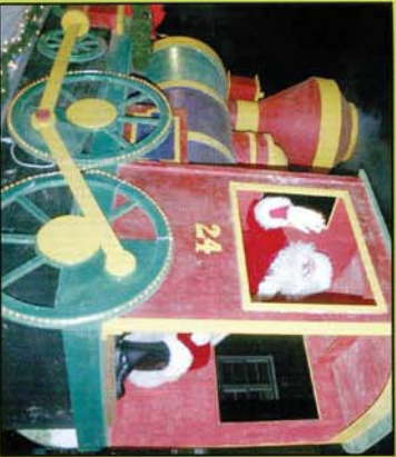
Santa in the Irvington Christmas Parade.