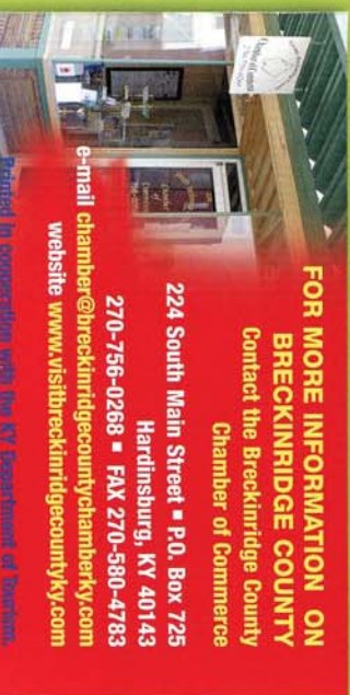
Formed in cooperation with the KY Department of Tourism

224 South Main Street • P.O. Box 725 Hardinsburg, KY 40143 270-756-0268 • FAX 270-580-4783 e-mail chamber@breckinridgecountychamberky.com website www.visitbreckinridgecountyky.com