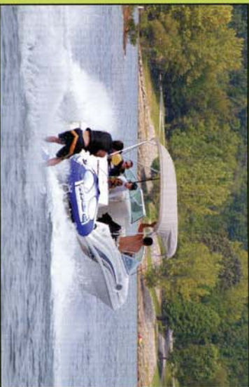
Water skiing on Rough River Lake.