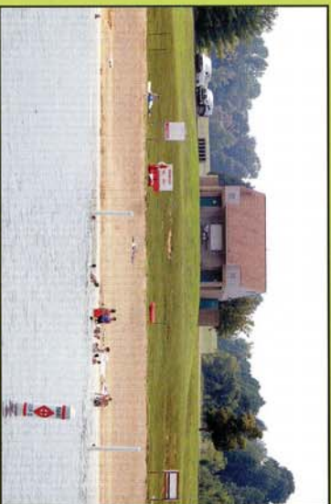
Swimming at the State Park Beach.