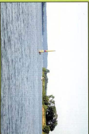
Sailing on the Ohio River.