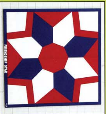
One of the 40 plus quilt blocks in the Breckinridge County Clotheshine of Quilts project. This is a friendship star pattern on the Irvington City Hall.